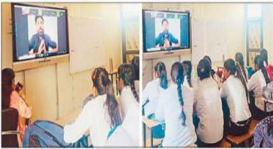
वेबीनार में भाग लेते जी.डी.सी. भगवती नगर के छात्र।